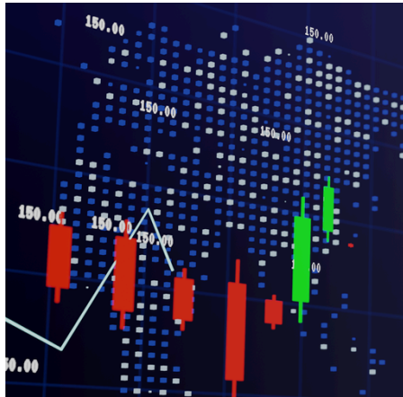
Accounts & Finance