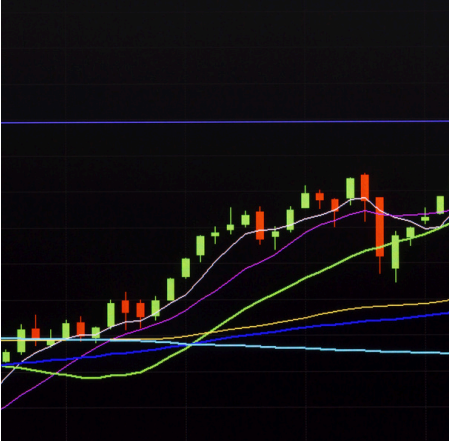
Financial Services Legal